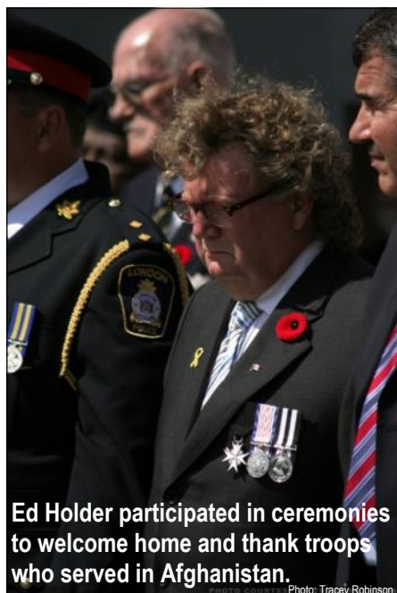
Ed Holder participated in ceremonies to welcome home and thank troops who served in Afghanistan.