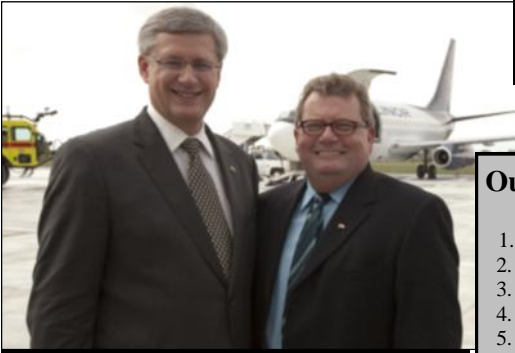
Prime Minister Stephen Harper and Member of Parliament Ed Holder at the London Airport.