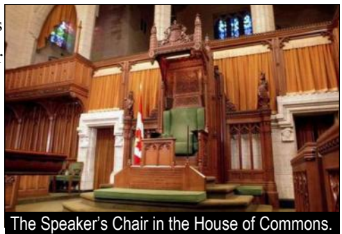
The Speaker's Chair in the House of Commons.

The Speaker of the House of Commons is elected by secret ballot by the House itself after each general election. He or she must be a Member of Parliament. The Speaker is the highest presiding officer, decides all questions of procedure and order, controls the House of Commons staff, and is expected to be impartial, non-partisan and as firm in enforcing the rules against the Prime Minister as against the humblest opposition backbencher. Several Deputy Speakers assist the Speaker.