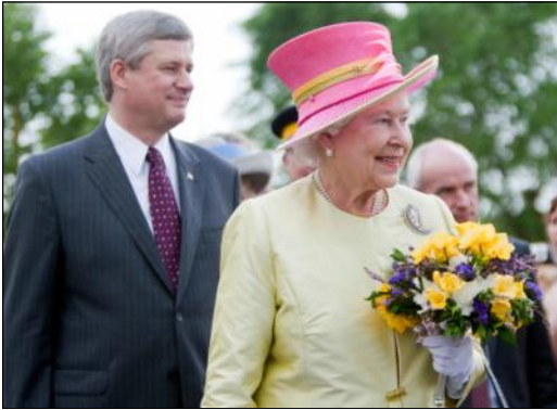
Prime Minister Stephen Harper and Her Majesty Queen Elizabeth II, Queen of Canada

The Queen is the formal head of the Canadian state. She is represented federally by the Governor General, and provincially by the Lieutenant-Governors. All Federal Acts of Parliament begin with the words: “Her Majesty, by and with the advice and consent of the Senate and the House of Commons of Canada, enacts as follows”. Acts of Legislatures in most provinces begin with similar words. All Members of Parliament swear allegiance to the Queen of Canada and Her successors.