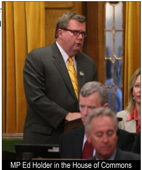
MP Ed Holder in the House of Commons

All these statements are available at www.edholder.ca or by searching 'Ed Holder, MP' on YouTube.