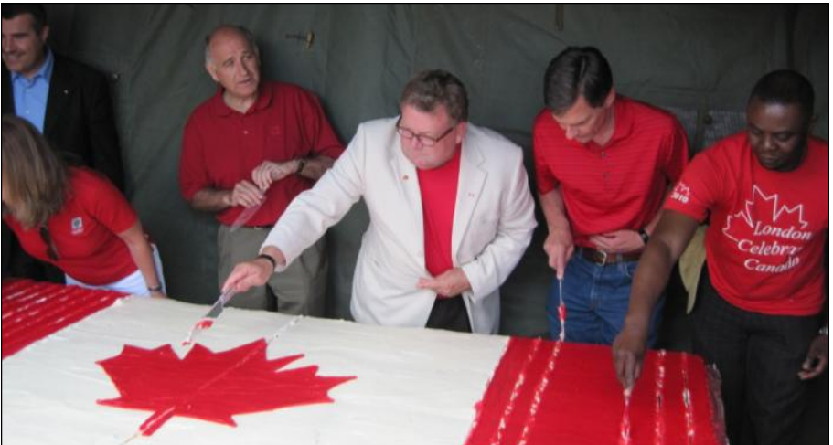
Politicians of all political stripes celebrate together on Canada Day at Harris Park

“O Canada” was proclaimed Canada’s national anthem on July 1, 1980, one hundred years after it was first sung on June 24, 1880. The music was composed by Calixa Lavallee, a well-known composer; French lyrics to accompany the music were written by Sir Adolphe-Basile Routhier. The song steadily gained in popularity. Many English versions have appeared over the years. The version on which the official English lyrics are based was written in 1908 by Mr. Justice Robert Stanley Weir. The official English version includes changes recommended in 1968 by a Special Joint Committee of the Senate and the House of Commons.