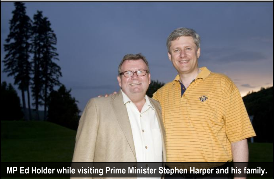
MP Ed Holder while visiting Prime Minister Stephen Harper and his family.