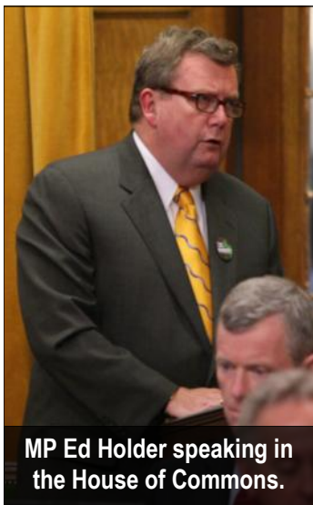
MP Ed Holder speaking in the House of Commons.