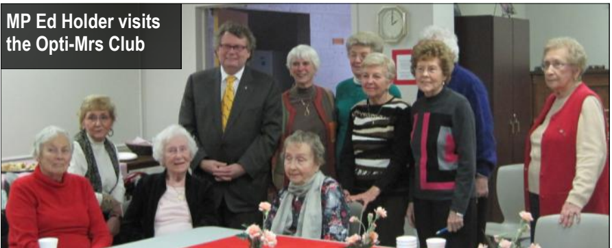
MP Ed Holder visits the Opti-Mrs Club

Our Government created a Minister responsible for Seniors to represent them at the Cabinet table and created a National Seniors Council to give Seniors a say in the issues that matter to them (learn more at www.seniorscouncil.gc.ca ).